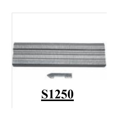
(Fits Fletcher Framemaster)

Framer's points are metal tabs used at the back of the frame to secure the glass, matboard, foamboard and art. The advantage that Framer's points have is they are flat, fire perpendicular into the frame and cover a broader area against the surface of the stack.