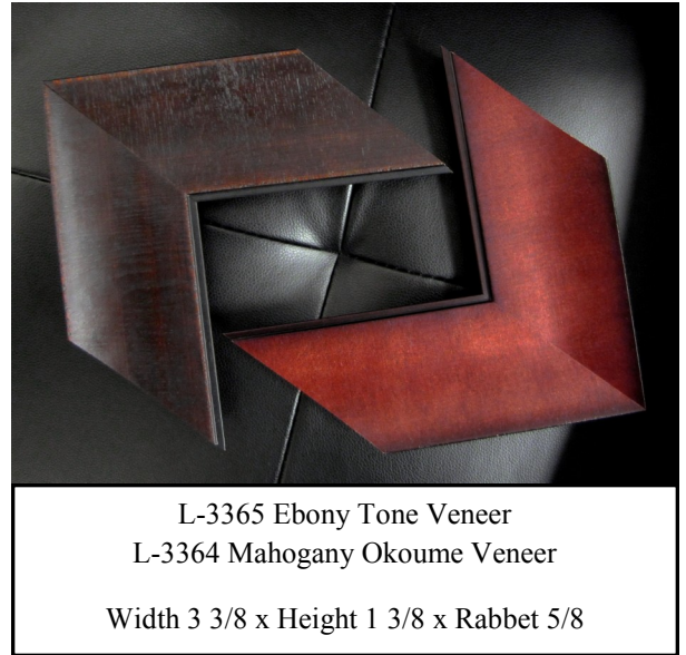
L-3365 Ebony Tone Veneer L-3364 Mahogany Okoume Veneer

The Signature Collection will continue to develop and grow as we add additional larger mouldings in a variety of styles.